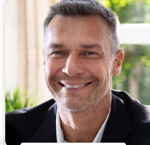
Key Decision Maker

Head Teachers spend little time teaching in the classroom, instead concentrating on overseeing the school and motivating staff and pupils. Their primary focus is ensuring students can progress and meet their potential, and setting the school's values and strategic direction.